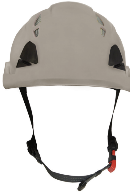
(Front with Chin Strap)