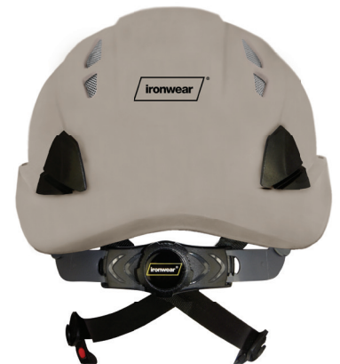
(Back with Ratchet)